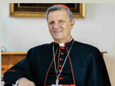
The Secretary General: Cardinal Mario GRECH