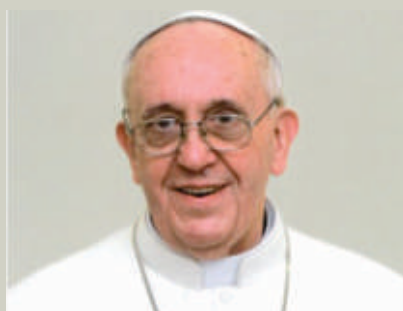
The President: His Holiness Pope Francis