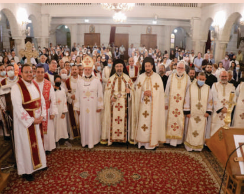
Egyptian Coptic Catholic Patriarch Presides over the Synod Procession.